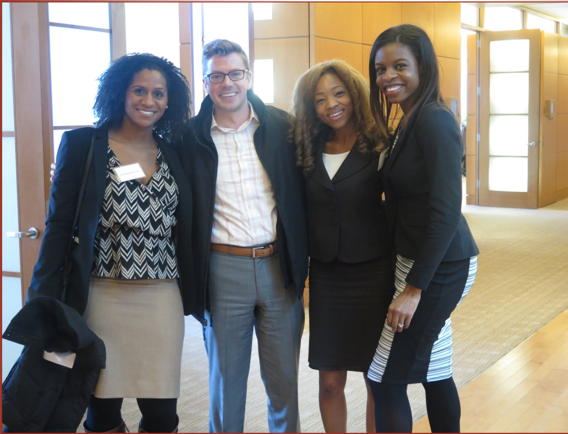
GABWA and Gate City Bar Association student members at the Law Student Interview/Resume Workshop