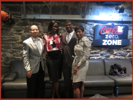
GABWA members enjoyed an April Membership Mixer sponsored by the Cochran Firm.