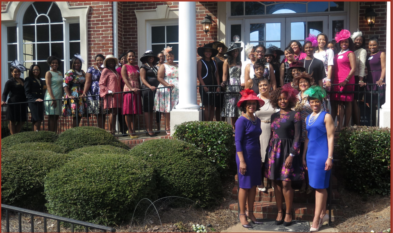
GABWA's 2016 Leadership Team enjoyed an afternoon of food and fellowship at the 10th Annual Leadership Tea.